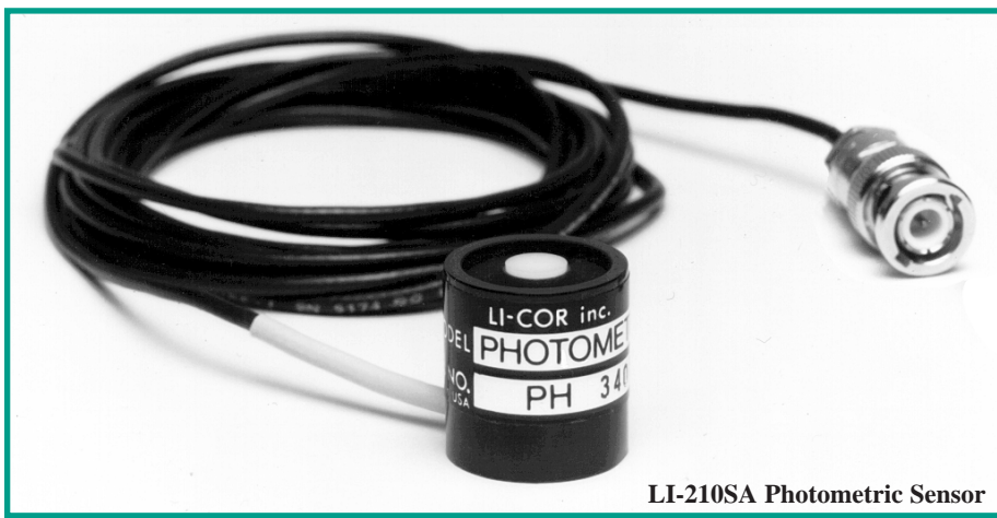
LI-210SA Photometric Sensor